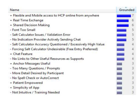
Figure 3 – Participant Feedback by Frequency

The qualitative data was imported into a qualitative analysis tool, ATLAS.Ti [31]. Inductive thematic coding [32] occurred in two stages: 1) open coding and 2) axial coding [33]. First, a comprehensive code list was increasingly built as each piece of qualitative data was openly coded. Open coding involves reading through the data several times, and labeling chunks of data. Afterwards, the frequency or "groundedness" of each code (Figure 3) was reviewed to identify the most common feedback, either positive or negative (prefixed with a plus and minus sign, respectively).