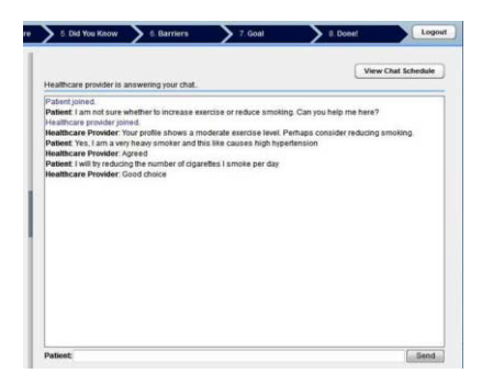
Figure 2 – iheart decision making and chat box

SDM via an online chat system (Figure 2) represents a novel approach for healthcare. Thus, several rounds of testing were applied to objectively prepare the system for evaluation. First, two medical doctors and two hypertensive patients critically reviewed the first-cut of the iheart prototype. Adjustments followed in response to this initial, informal feedback.